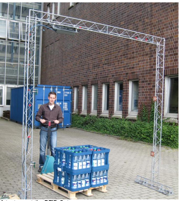
A test run at the RFID-Gate

Experimental scenarios involving an RFID gate the size of a refrigerated container verified the effectiveness of the new software. Results showed that using the new middleware significantly reduces the time needed to register the waybills. The time needed from recognizing a transponder to complete installation and the initialization of the bundles now takes less than one second. The use of OSGi allows RFID event